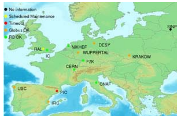
Figure 2: LCG Grid Monitoring Map

grid. A secure (https) X509 certificate based front-end (GridSite), allows remote site administrators to maintain resource centre configuration details in a SQL database used by the automated monitoring tools. PBS/LSF filters, provided by the RGMA software infrastructure, allow for the aggregation of accounting information per resource centre and per Virtual Organisation (VO). The GOC also uses the GridIce monitoring tool which is based on Nagios.